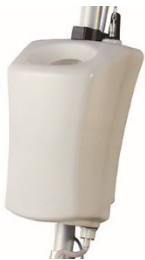
12 litre solution tank with control valve