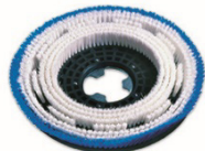
Carpet brush soft