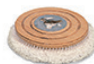
Soil-Sorb bonnet pad