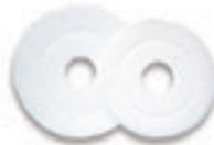
Microfibre bonnet pad